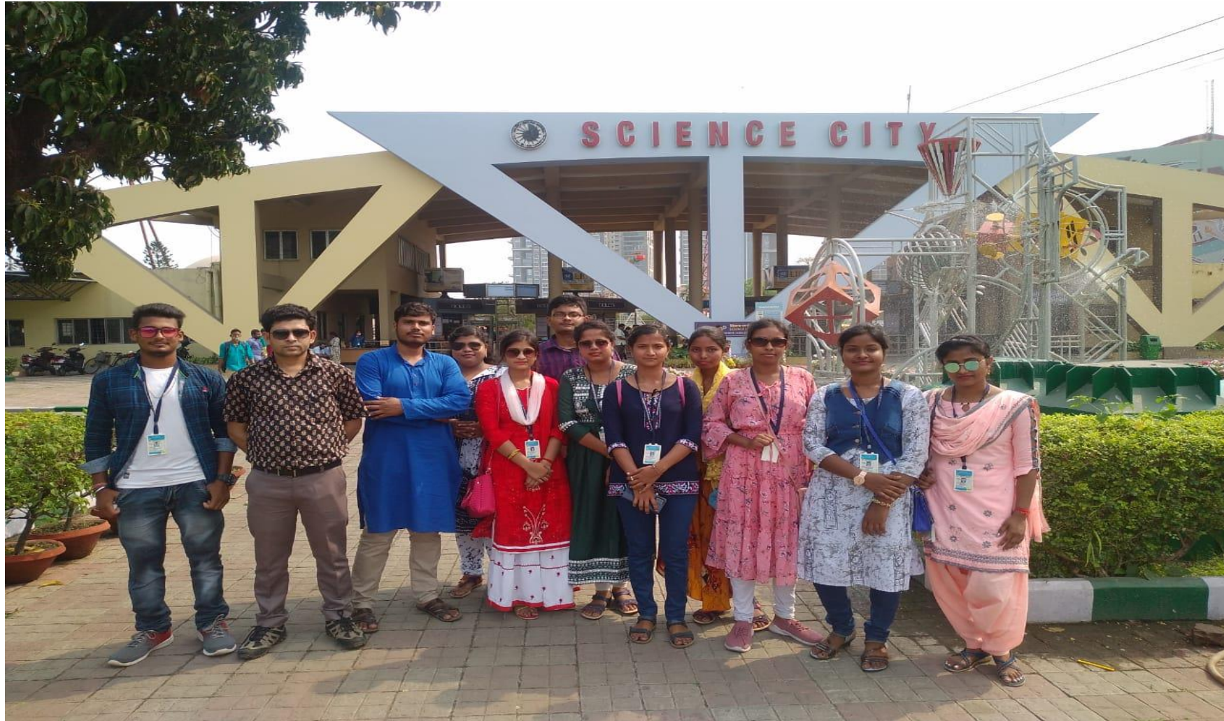
Department of Education in front of science City. April,2,2022.

education institutions there such as Amity University, Sister Nivedita University and Ramakrishna Mission Research Centre at New Town. In the end, they visited Eco Park and stayed there till 5:00 P.M. and returned Udaynarayanpur at 7:30 P.M. safely.