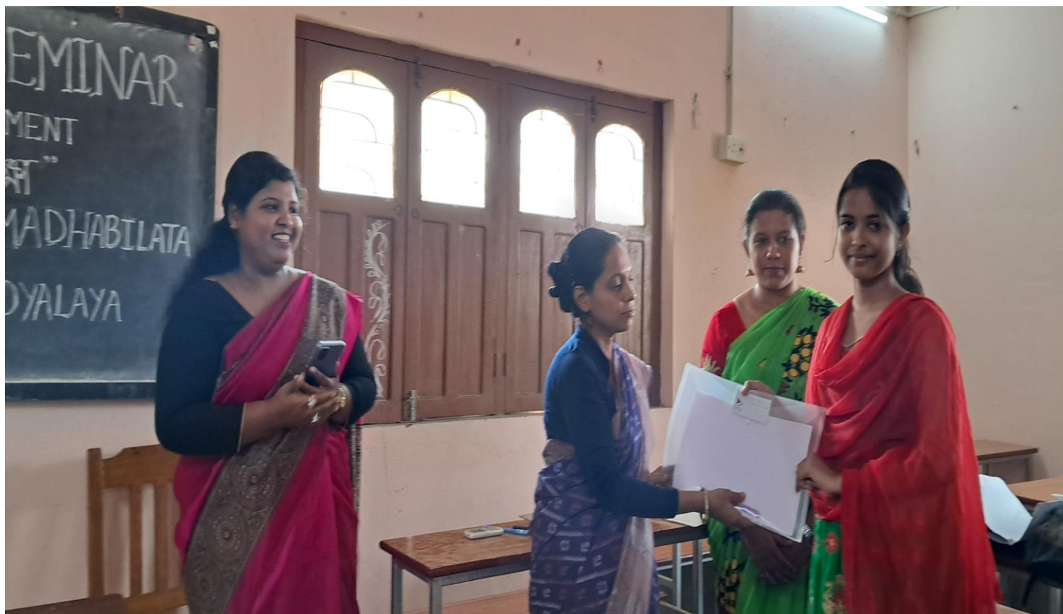
Students are being felicitated by the teachers