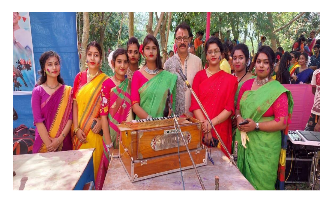
On 16 March 2022, the students as well as the teachers of Udaynarayanpur Madhabilata Mahavidyalaya organized and also actively participated in a very nice and excellent cultural programme on the occasion of Basanta Utsav.