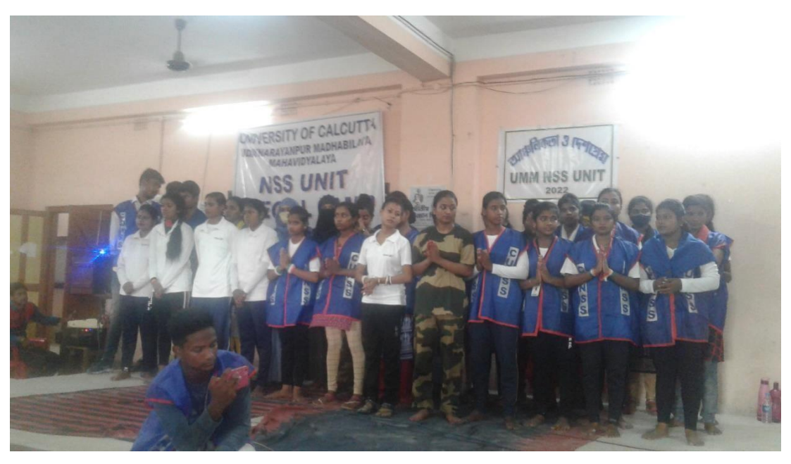
On 12 April 2022, the students of NSS Unit of Udaynarayanpur Madhabilata Mahavidyalaya organized and also actively participated in a very nice and fantastic cultural programme after completion of NSS Unit Special Camp which was conducted from 25 March 2022 to 31 March 2022.