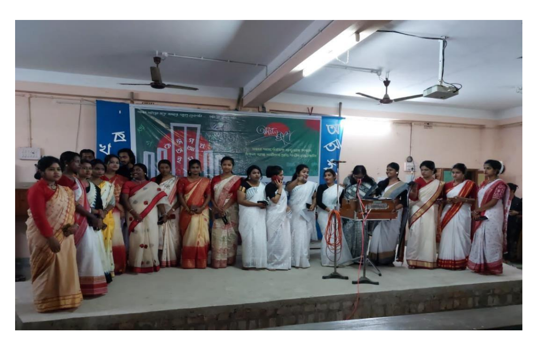
On 22 February 2022, the students as well as the teachers of Udaynarayanpur Madhabilata Mahavidyalaya organized and also actively participated in a very nice and heart-touching cultural programme on the great and auspicious occasion of International Mother Language Day Celebration.