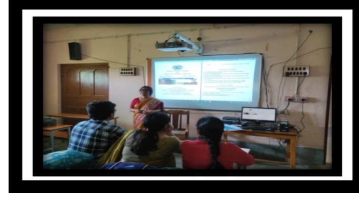
One day seminar, Dept. of Philosophy

One day seminar, Dept. of Nutrition & Physical Education